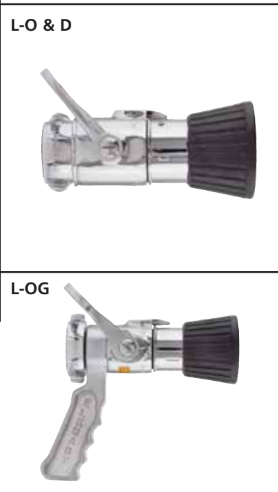
Figures depict general product types only and are not intended to be inclusive of all product features.

All nozzles are NHT unless otherwise specified. See index T-13 for optional base threads, including British instantaneous.