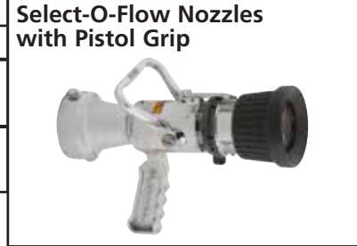
Figures depict general product types only and are not intended to be inclusive of all product features.