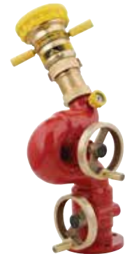
HAND WHEEL (4)