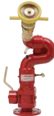
INTEGRATED VALVE (1)