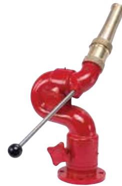
TILLER BAR (3)